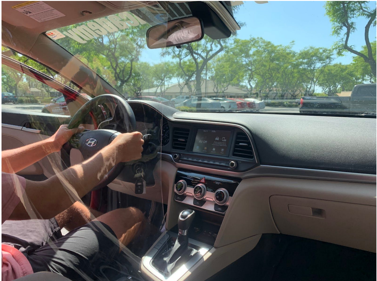
Inside Varsity Driving Academy's vehicles showing a see-through barrier for protection.

Our company's commitment has always been safety. We are a Company that promotes and is committed to teaching safety on California streets for all drivers. We extend our focus and commitment to the health and safety of our customers and employees during this unprecedented time of the Covid-19 Pandemic and herein place these standards and practices into effect until further notice.